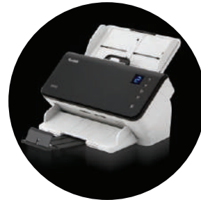
Kodak E1025 and E1035 Scanners

* Throughput speed may vary depending on your choice of application software, operating system, PC and selected image processing features.